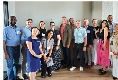
Elected officials tour PPL’s Maya Commons

The Minnesota Legislature approved the Stable Housing Organization Relief Program (SHORP) , a $50 million grant program administered by the Minnesota Housing Finance Agency that benefits more than 26,000 households living in affordable and supportive housing across Minnesota. PPL was the recipient of $2 million .