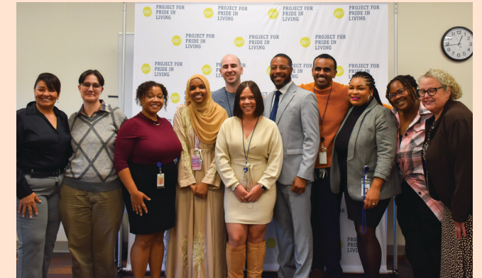
PPL Emerging Leaders cohort

The second Emerging Leaders cohort graduated in November of 2023, a nine-month program created to promote individual growth in three primary areas: race equity, a coaching mindset, and leadership competencies. Staff engaged with community leaders and collaborated for a capstone project, all while centering the experience of historically marginalized individuals. Out of the 12 graduates, eight have been promoted in either internal or external roles.