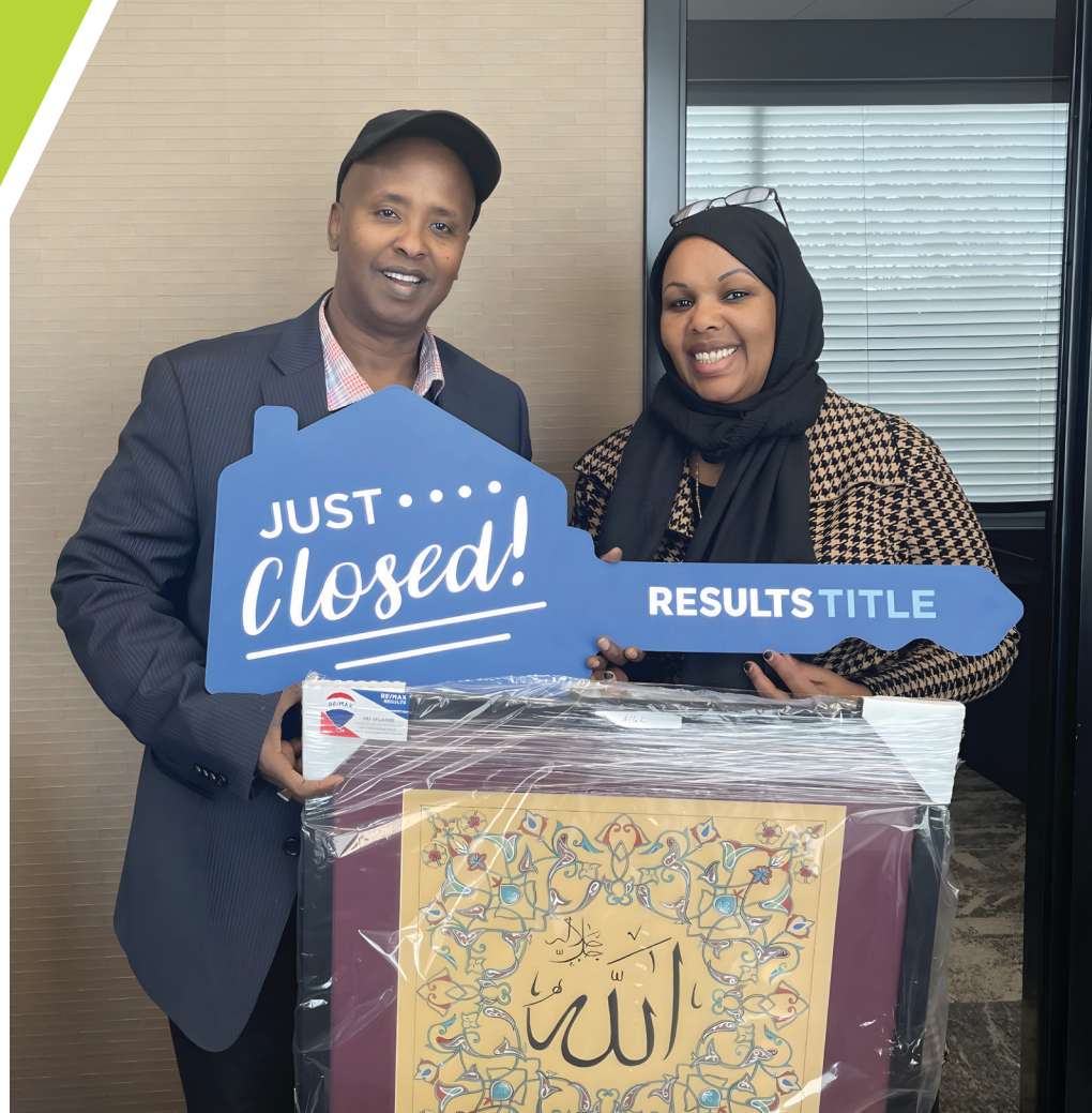
Bashe Site closes on College House tri-plex

PPL piloted a program in 2023 to collaborate with emerging developers to buy our small, scattered-site properties, and “College House” in South Minneapolis was our first successful sale. The first of many to come, this tri-plex property was sold at a below-market price, with the buyer enjoying down payment assistance, a reserve pool to help cover unexpected costs to maintain each of the units, and property management consulting. The property was improved before the sale, all in an effort to return true community assets to community members. The newly named “RE-Seed” program is expected to launch to grow emerging developer capacity and assets in the fall of 2024.