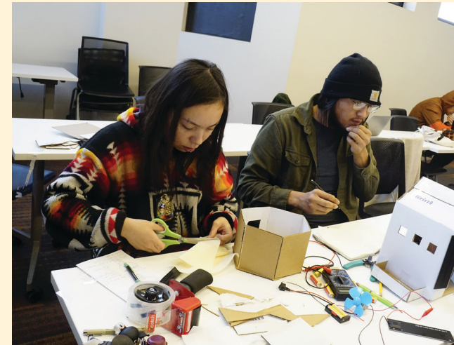
LEAP participants learn about solar energy through hands-on projects

New funding has helped PPL’s Learn, and Earn to Achieve Potential (LEAP) program expand to new programs and include more young people. Through an “Introduction to Solar Energy” 20-hour course offered by LEAP Partner, Just B Solar, youth learned the ins and outs of solar energy through hands-on projects in a series of solar workshops.