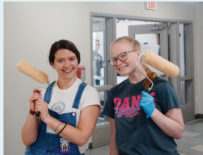
Volunteers repaint the CVI residence

PPL invested more than $800,000 in building improvements in 2023. Coupled with services to residents and PPL properties, the investment grew to more than $3.5 million—much of that paid to BIPOC vendors in nearby communities.