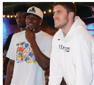
Timberwolves players at the ping pong event